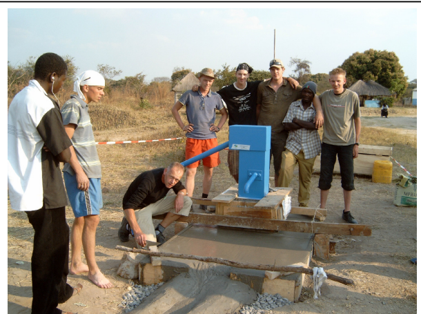
The construction group of Mission Possible Mpongwe July 2007