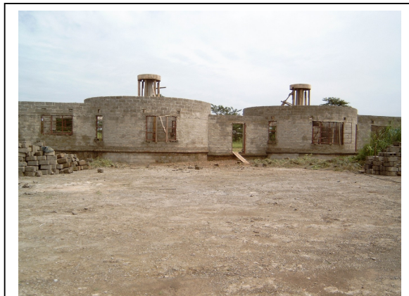
guesthouse januari. 2008

This project has progressed despite the many challenges faced during the year. At the beginning of the year we suffered as the whole country experienced a severe shortage of cement and the hugely increased prices that resulted from the scarcity. This problem continued for nearly six months and the price of cement is only now normalising. We have also experienced a lack of water on site for large parts of the year, due to the breakdown of the District Council water pump. This was further compounded by the fact that the site was not connected to mains water, nearly two years after the service charges were paid. The Executive