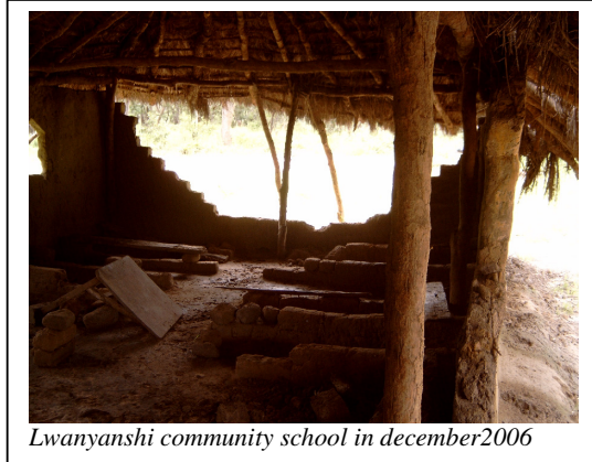
Lwanyanshi community school in december 2006

The digging of the foundation and the construction of the slab were started in 2007. The slab is now approximately 75% complete at the moment following several delays on site, due to rains and the unavailability of the community contribution and, unfortunately, work has stopped.