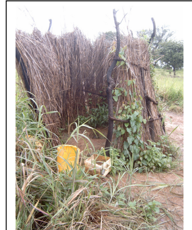
latrine for 300 children

The school has over 300 pupils from Grade 1 to Grade 6 and currently operates from two temporary structures consisting of four classrooms.