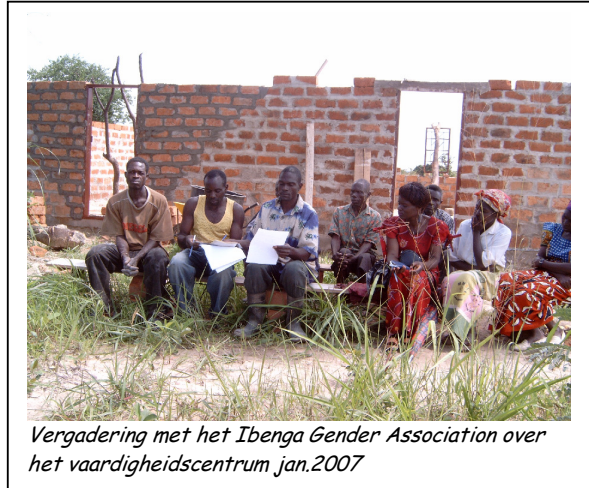
Vergadering met het Ibenga Gender Association over het vaardigheidscentrum jan.2007

At the end of 2007 there are a few items that remain outstanding for this project but classes in tailoring, carpentry and English language are already well under way. The Project Committee has agreed, in principal, to pay for the digging of a protected well at the project site.