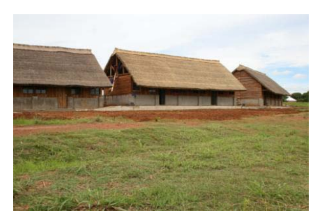
Other. During two weeks we could not use the truck while it was in the workshop for serious reparation. This caused the lacking of materials, in particular cement. Carpentry could continue without problems but a group of helpers had to work on activities that were not planned. The remaining of an anthill at the middle of the plot has been dug away in order to level the field( \uparrow ).

Plotnumber. The Ministry of Land in Ndola has assigned us plotnumber: 39750. Unfortunately this does not mark the end of the procedure to confirm our plot. The coordinates in the drawing from the planning office show that our plot is twice as big as assumed until now. It appears that in the past GCMF bought two pieces of land within our own plot from neighboring families (Kafweni and Milambo). In order to fix this situation I'll do a proposal to the both families to trade the needlessly acquired pieces of land for pieces of the same size outside of the plot. Ones agreed on by the two families and witnessed by the director of works of the council, I'll have to go back to the Planning Office and the Ministry of Land with the new coordinates. All this has to be done before I can apply for the building permit. See drawing on next page.