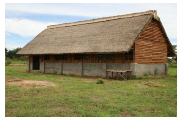
13 Administration 1. Finished covering, cross ventilation, assembled and fixed window frames(↑).