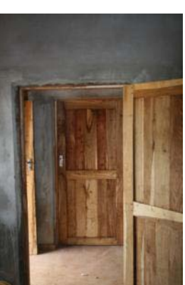
8 Boarding Girls 1. Assembled and fixed four interior doors on the left side (↑). Except for painting and ceilings this building is finished.

9 Boarding Gilrs 2. Finished thatching the roof( \downarrow ), assembled and fixed all the window frames, finished the window sills, finished covering and finished plastering the interior walls( \downarrow ).