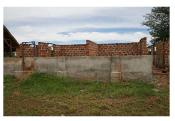
17 Boarding Boys 1. Finished interior masonry up to ring beam level including reinforcement of the foundation( \uparrow ).