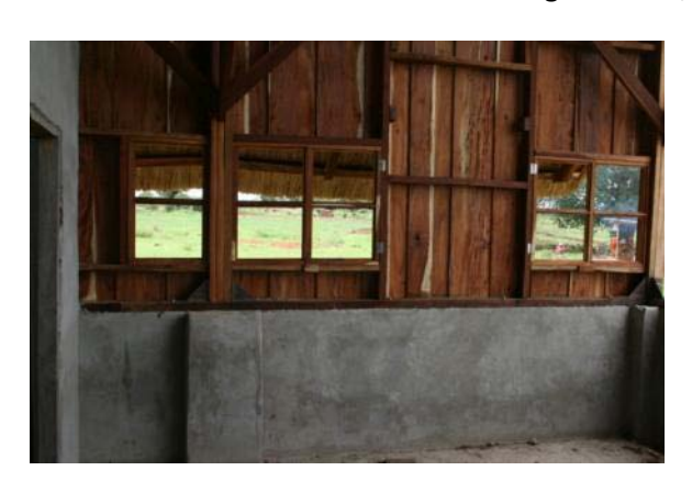
14 Administration 2. Finished covering backside, assembled and fixed all window frames (\downarrow) .