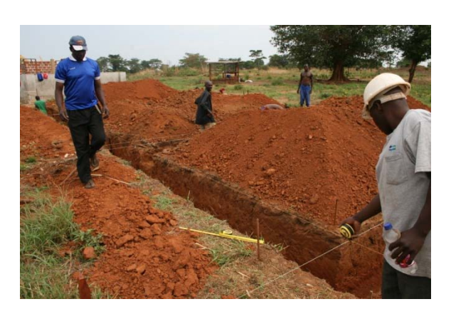
18 Boarding boys 2. Finished digging the foundation hole ( \uparrow ).