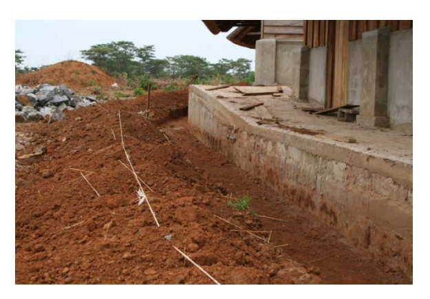
Other. In the period when there were no financial means to continue constructing we did stock count and re-piling of timbers, tree chopping as preparation of the agricultural land (and also for firewood to burn bricks) and continued baking bricks ( \downarrow ).