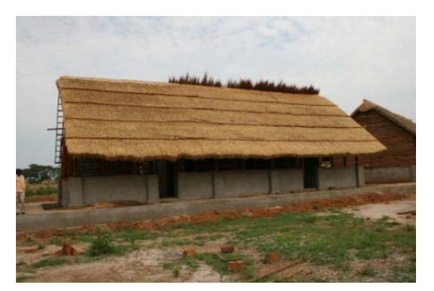
9 Boarding Girls 1. Finished thatching front side ( \uparrow ). Finished interior masonry ( \downarrow ).