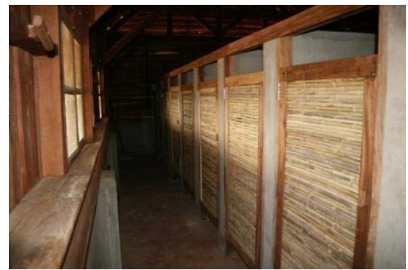
7 Sanitary Girls. Finished fixing the bamboo doors at the toilet side ( \uparrow ). Assembled and fixed the technical hallway door ( \downarrow ).