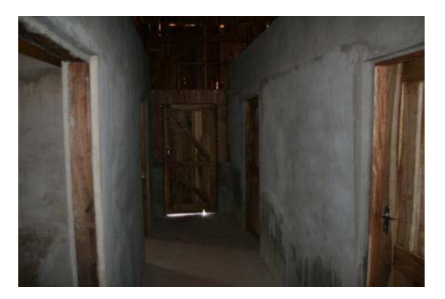
8 Boarding Girls 2. Assembled and fixed four interior doors on the right side ( \uparrow ) and finished the cable boxes ( \downarrow ).